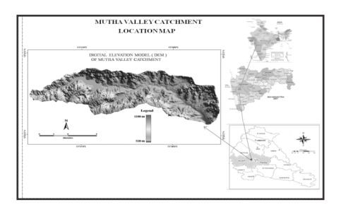
Fig 1. Location map of the Mutha Valley.

The study area experiences tropical type of climate with monsoonal rains from the south-west monsoon winds. The average annual rainfall in the study area is 1395.14 mm. Figure 2 introduce rainfall variation in the study area